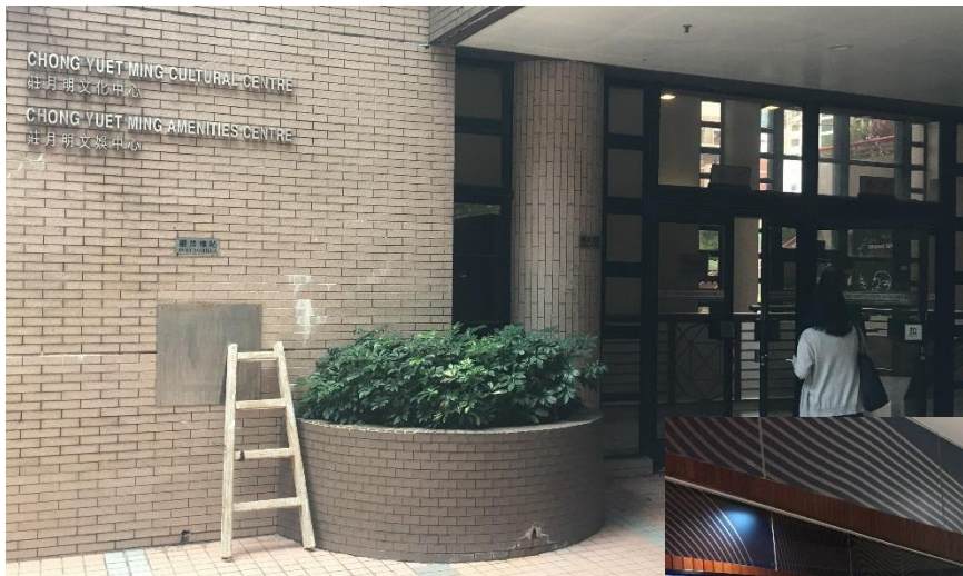
Top: Chong Yuet Ming Amenities Centre (CYM) (莊月明文娛中心). Right: 4 th floor of CYM

3. At the end of the University Street, you will find Chong Yuet Ming Amenities Centre (CYM) (莊月明文娛中心). Take the escalators in CYM to the 4 th floor, then turn right and pass through the door.