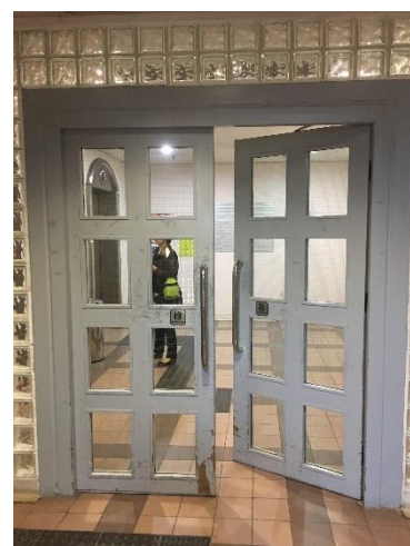
Left: Meng Wah Complex (明華綜合大樓). Right: Lift lobby